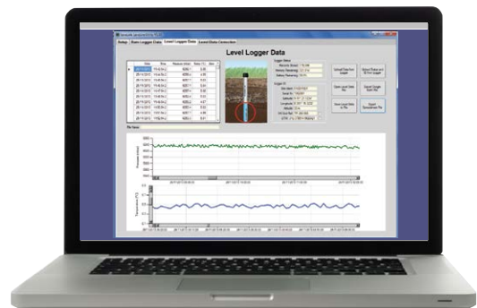
LevelLink PC Application

The LevelLine is set up using the LevelLink PC Software, LevelLine Meter or Quick Deploy Key. A variety of logging types are available these include Linear, Event Based, Schedule, Future Start, Future Stop, Deployed Start and Real Time View.